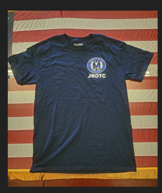
PT Shirt: $10 *Required

Every Monday and Friday, cadets will be required to change out into their PT uniform. (5 points each day)