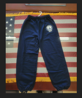
Sweatpants: $20 *Recommended