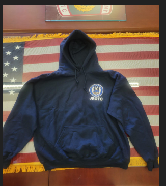
Hoodie: $20 *Required