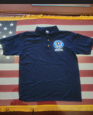
Polo shirt: $15 *Required