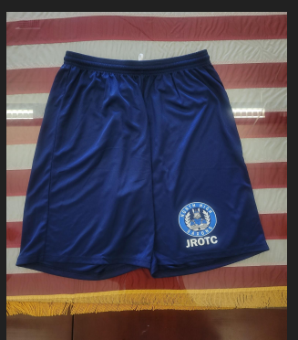
PT Shorts: $10 *Required